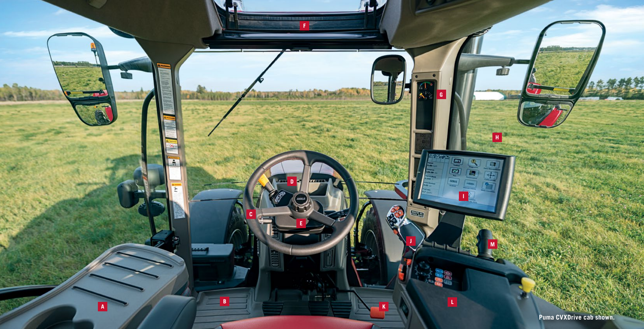
Puma CVXDrive cab shown.

A Instructional Seat: Ideal when training new operators or the seatback folds down to provide a work surface. (shown folded down)