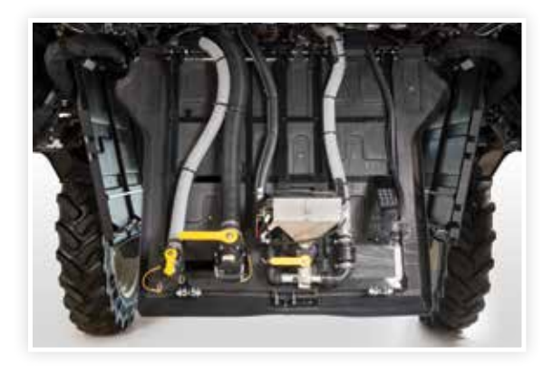
Easy access to the newly designed central filling station.